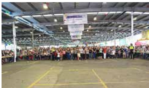
Packed Assyrian New Year Festival

Once again the Assyrian Australian National Federation (AANF) together with the Assyrian Universal Alliance (AUA) hosted one of the most successful Assyrian New Year Festivals in the last eight years where an estimated nine thousands people gathered at Fairfield showground to celebrate this historical event. The Festival which started at 10:00 am till 10:00 pm included Assyrian Folk Dancing on Monday 1 st April, 2013.