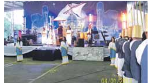
Assyrian Historical Tableau Emperor and Queen of Assyria