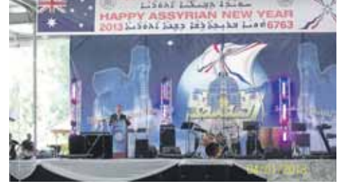
Assyrian New Year Festival at Fairfield showground