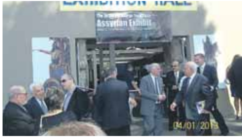
VIP guests at Exhibition