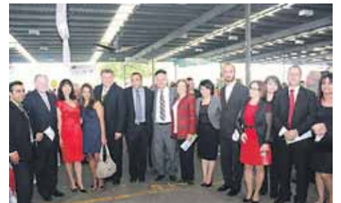
VIP Guests at Assyrian New Year Festival