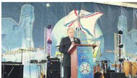
Rev Fred Nile addressing Assyrian New Year Festival