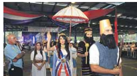
Dramatic Arts piece simulated the arrival of the King and Queen of Assyria