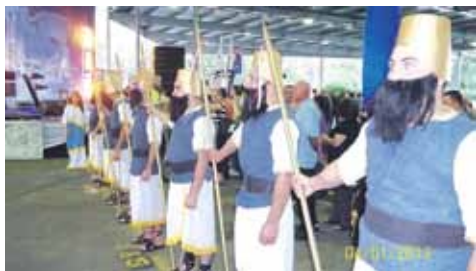
Assyrian Guard at Historical Tablo