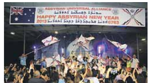
Joyful climax of Assyrian New Year Festival