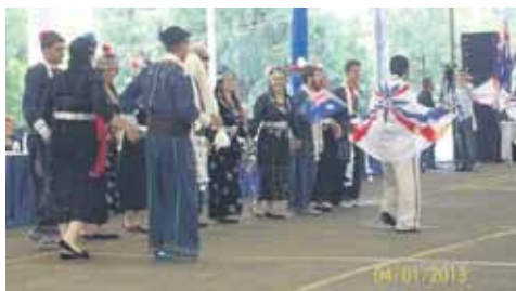
Assyrian Folk Dancers