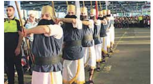
The Royal Assyrian Guard and attendants in procession